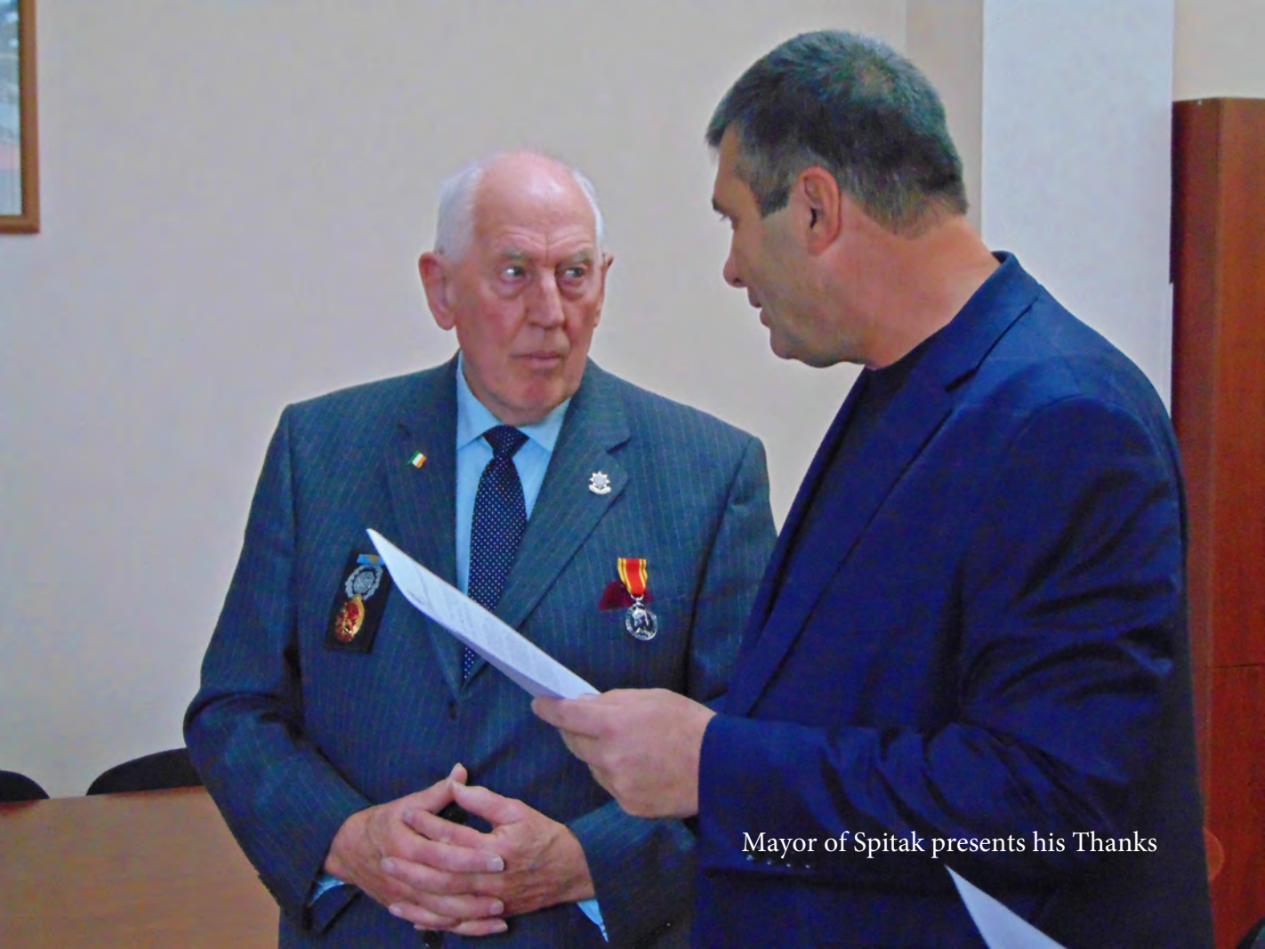
Mayor of Spitak presents his Thanks